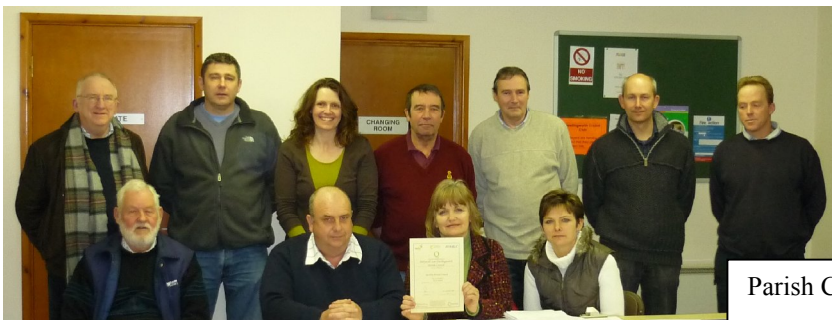
Parish Council with the Quality Council Certificate on the left

Streetlight not working Call 0800 253529 with column number and location. Or report via website www.cambridgeshire.gov.uk